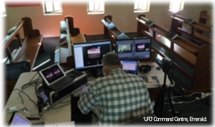
'UFO' Command Centre, Emerald.