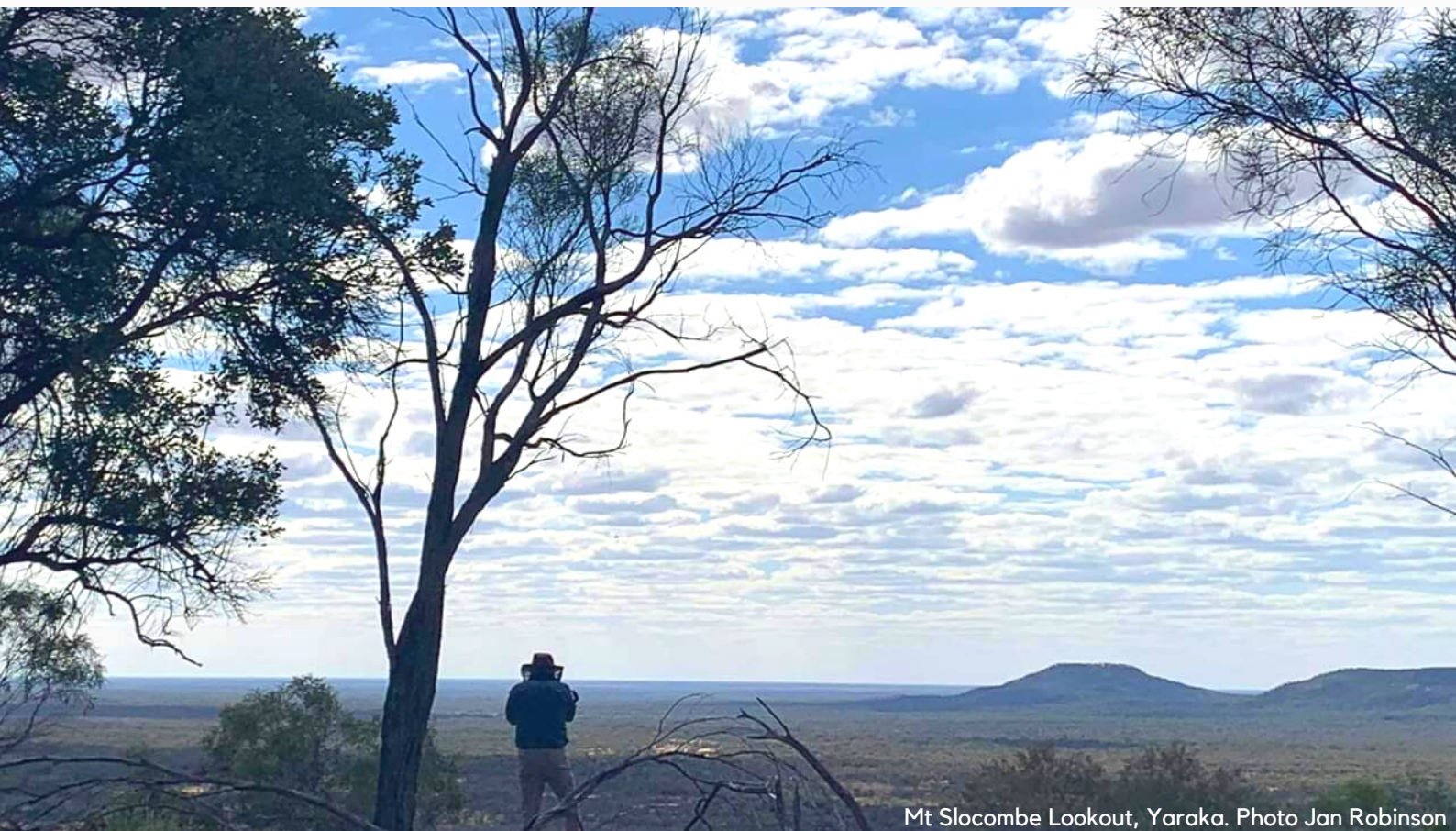
Mt Slocombe Lookout, Yaraka.